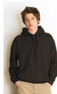
Gildan H/weight Blend Hooded Sweat (18500)