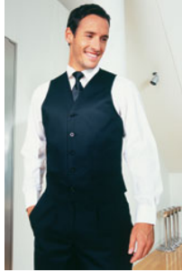
Mens Hospitality Waistcoat (PR620)

Shangatic Merchandise aim to provide you with the best value, quality, eco-friendly clothing. We only use top brands like Fruit of the Loom and Gildan. We can screen-print, flex-print and embroider logos and designs onto t-shirts, sweatshirts, hoodies, polos, caps and all types of clothing. Whether you need corporate clothing, work uniforms, school uniforms, workwear or wish to promote your organisation or event we have EVERY solution. To keep your garments looking as good as new for longer, all our clothing contains clear and concise wash care instructions, ensuring optimal performance and durability.