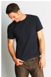
Gildan Adult 160gsm T-shirt (64000)